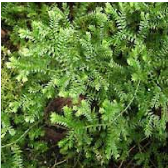
African club moss Selaginella kraussiana

Reference and further reading: Weedbusters.org.nz ; Wikipedia.org ; nzpcn.org.nz