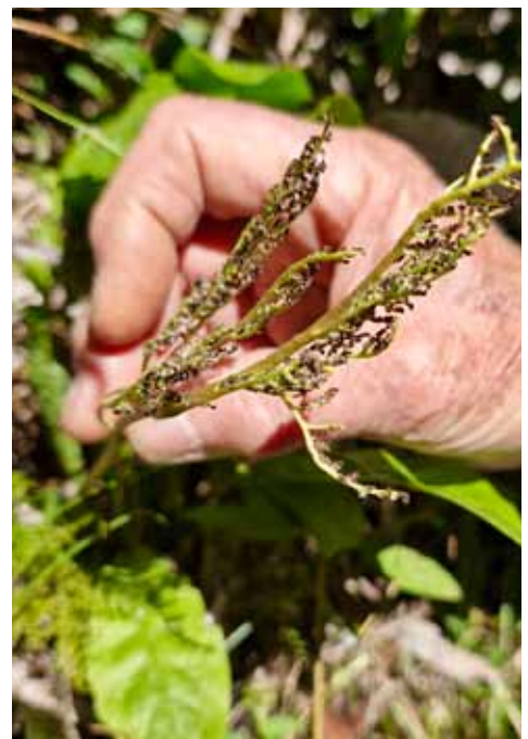
1. Botrychium australe the parsley fern.