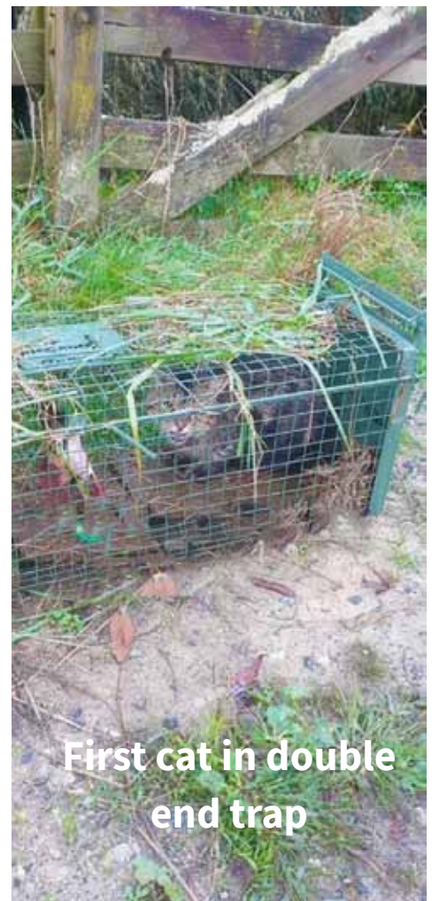
First cat in double end trap